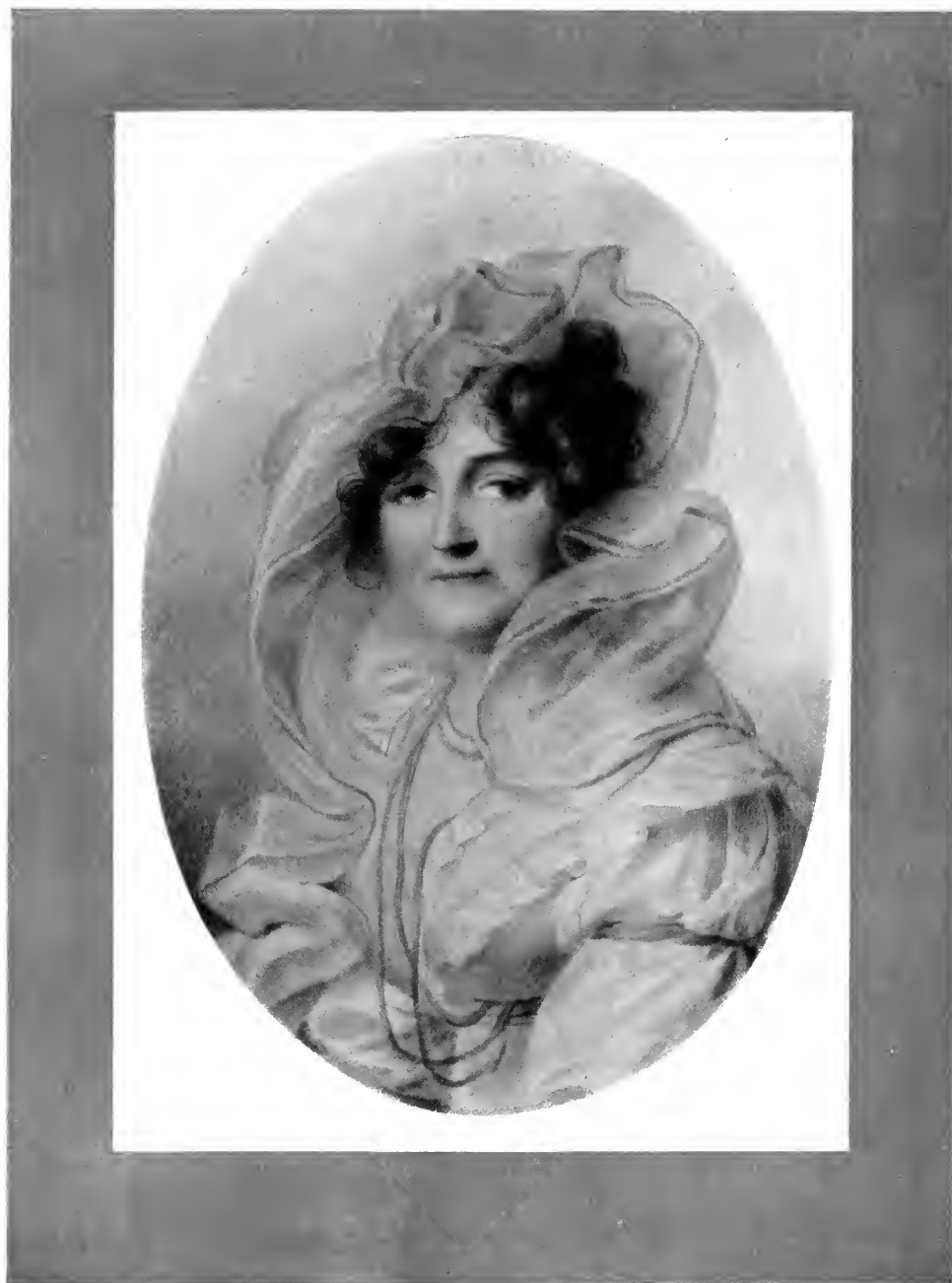
CATHARINE, COUNTESS BEAUCHAMP BY JEAN BAPTISTE ISABEY